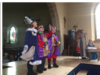
Maple Class nativity