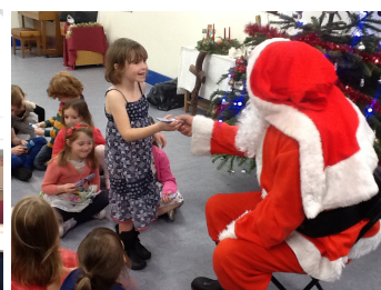
A special visitor!