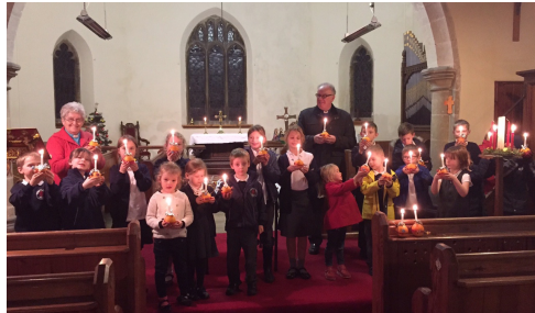
The Christingle service in St Mary's Church