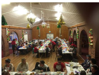
Friends' Christmas dinner

On Wednesday last week, our Christmas carol service took place in St Mary's Church. During the service, children in Oak Class read from the bible, some children performed Christmas carols on flute, clarinet and piano and others shared special prayers they had written. All of the children sang Christmas songs they had been learning and the children in Maple Class performed a wonderful traditional nativity. The collection at both services totalled £139.55. This will be divided equally between the school fund and the church. During the Christmas parties on Friday, we had a very special visitor and yesterday, after the pantomime at the Embassy Theatre in Skegness, the children (and staff) enjoyed playing in the sand dunes!