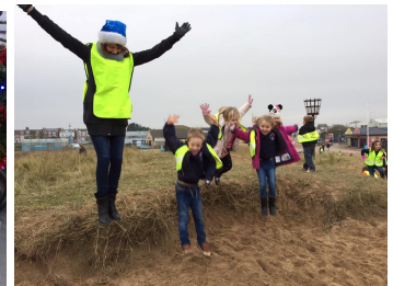
Fun in the sand dunes

For more pictures from these events, please visit the galleries section of the school website and follow us on Twitter and Facebook (@KOBPrimary).