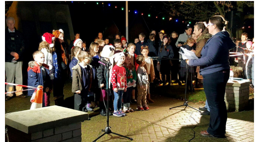
Some of our children at the Christmas market